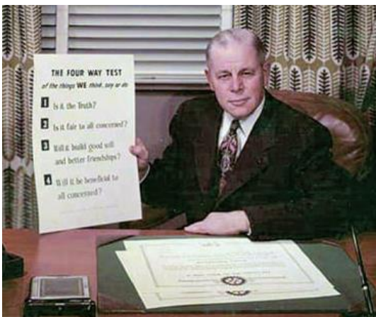
ROTARIAN HERBERT J. TAYLOR Author of the Four-Way Test

The Four-Way Test was created by Rotarian Herbert J. Taylor in 1932 when he was asked to take charge of the Chicago based Club Aluminium Company, which was facing bankruptcy. Taylor looked for a way to save the struggling company mired in depression-caused financial difficulties. He drew up a 24-word code of ethics for all employees to follow in their business and professional lives.